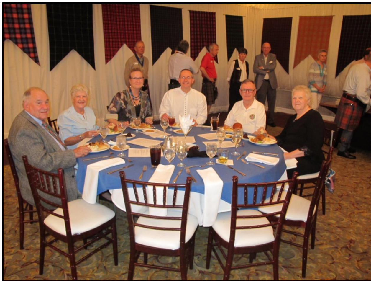
The gang's all here