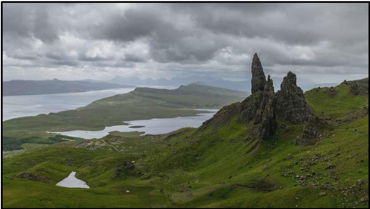
Isle of Skye