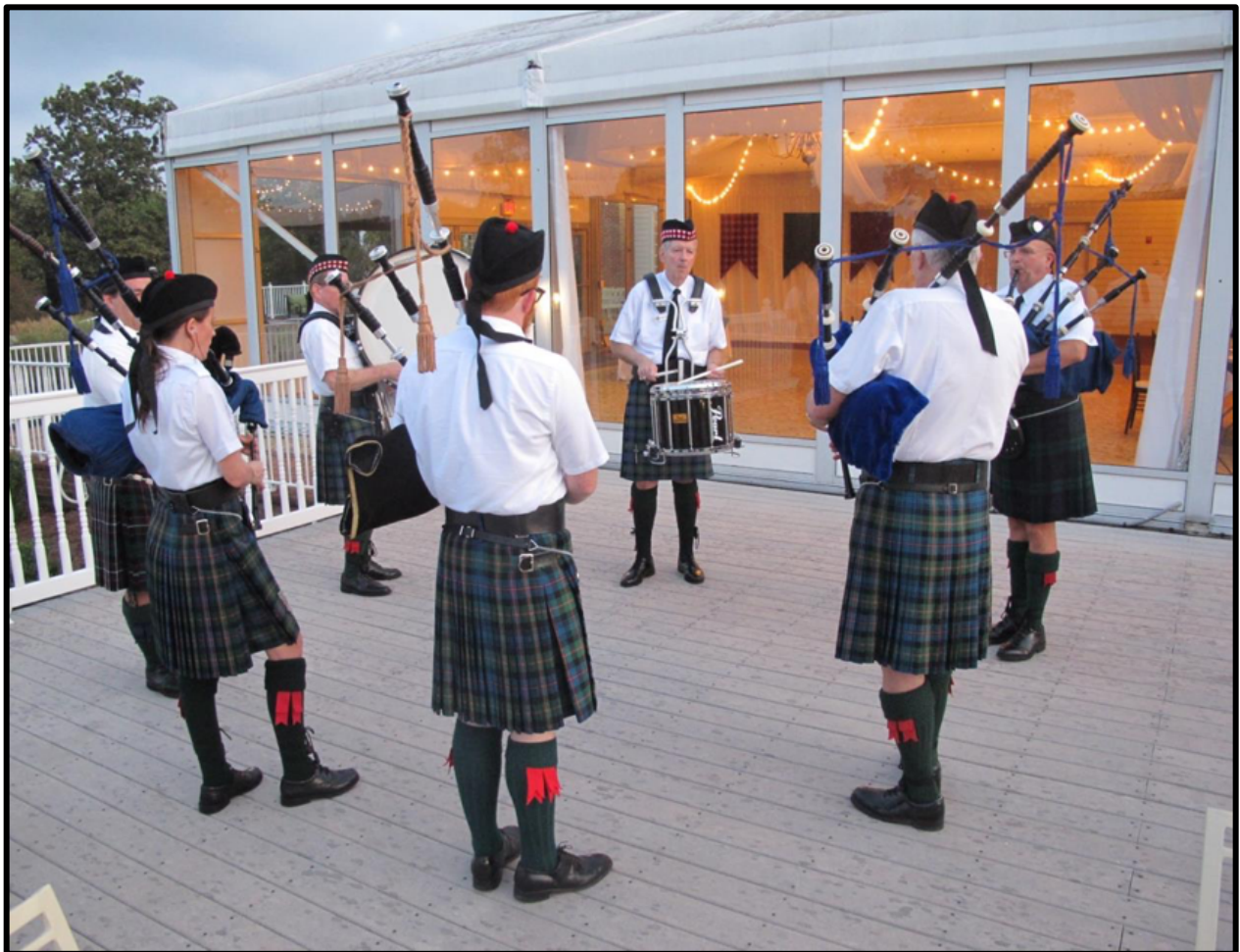
Williamsburg Pipes & Drums