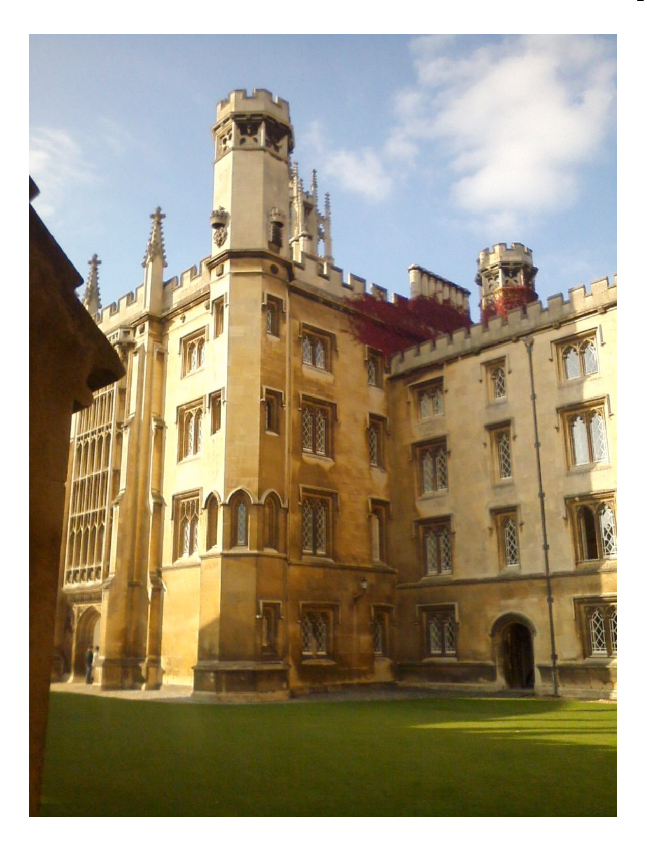
New Court of St. John's College