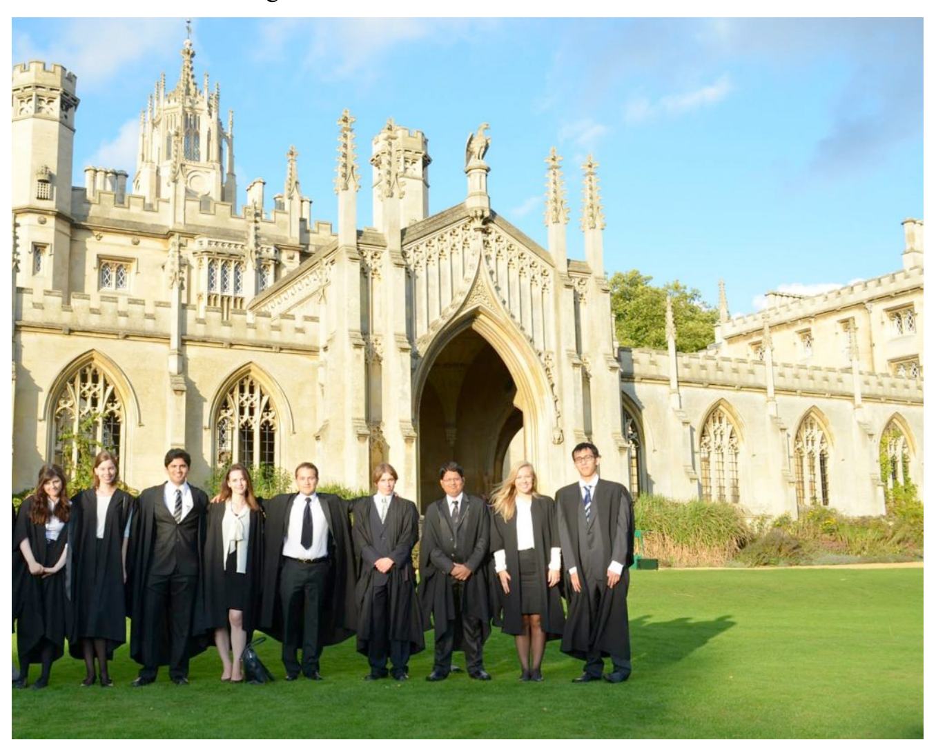
Some fellow Johnians and I (six from the left) in front of New Court.