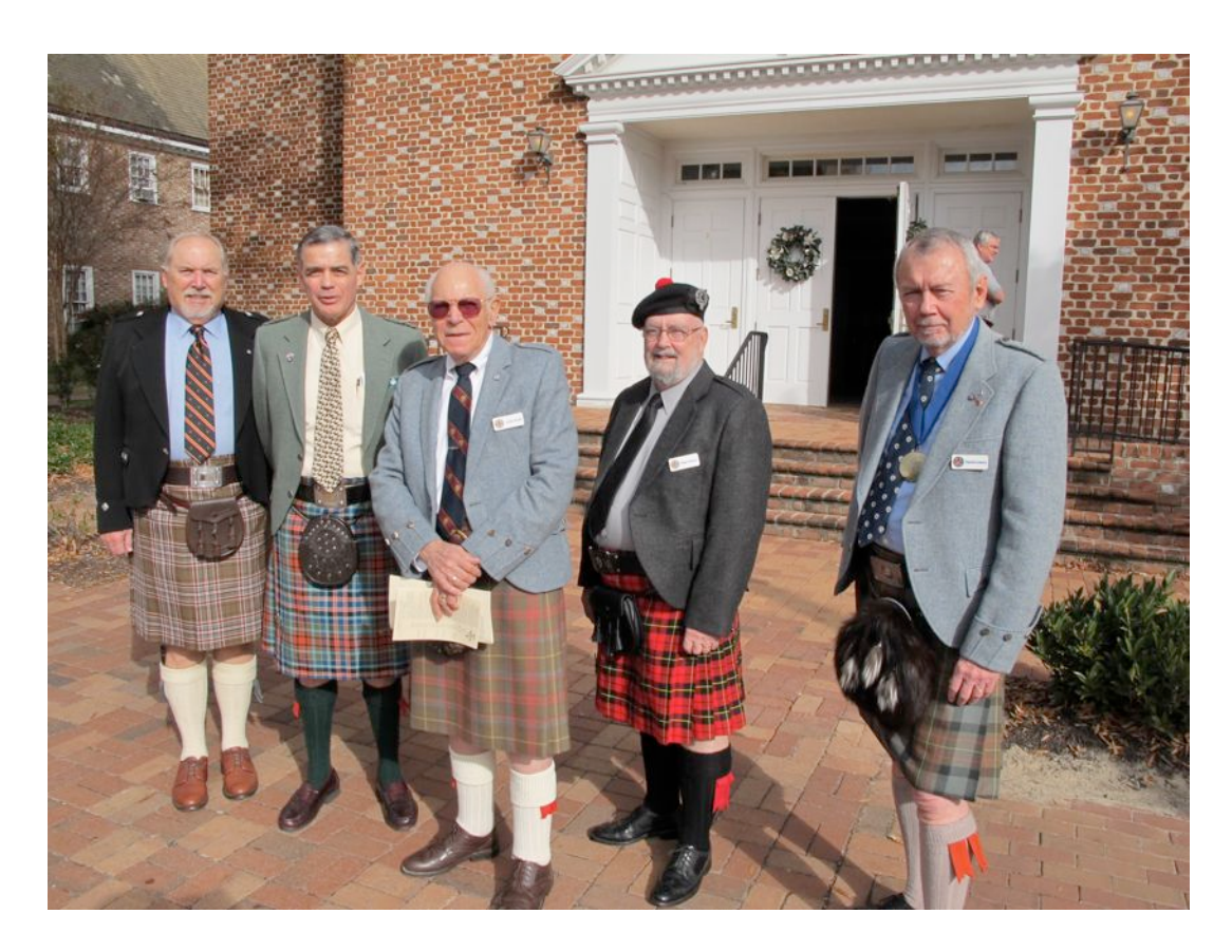
The Gang's all here!