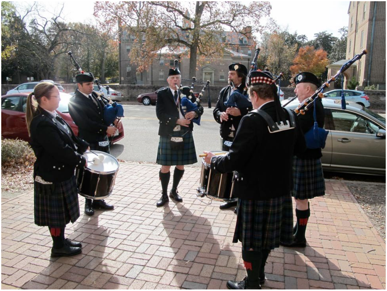
Williamsburg Pipes & Drums