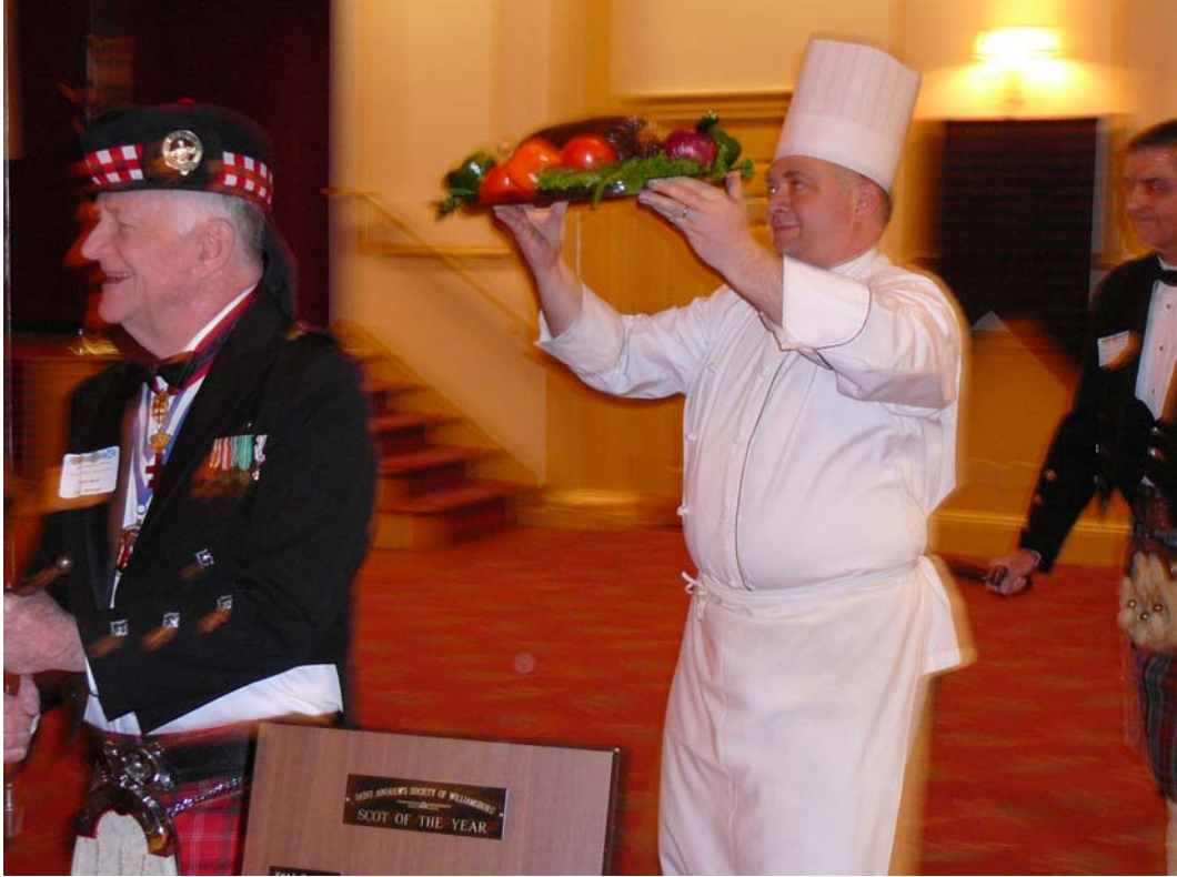
The cook shows off the haggis