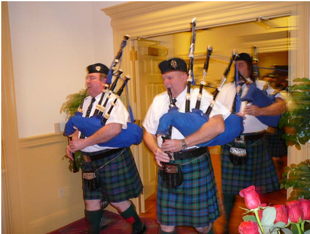
The Williamsburg Pipes & Drums enters in a blast of bagpipes