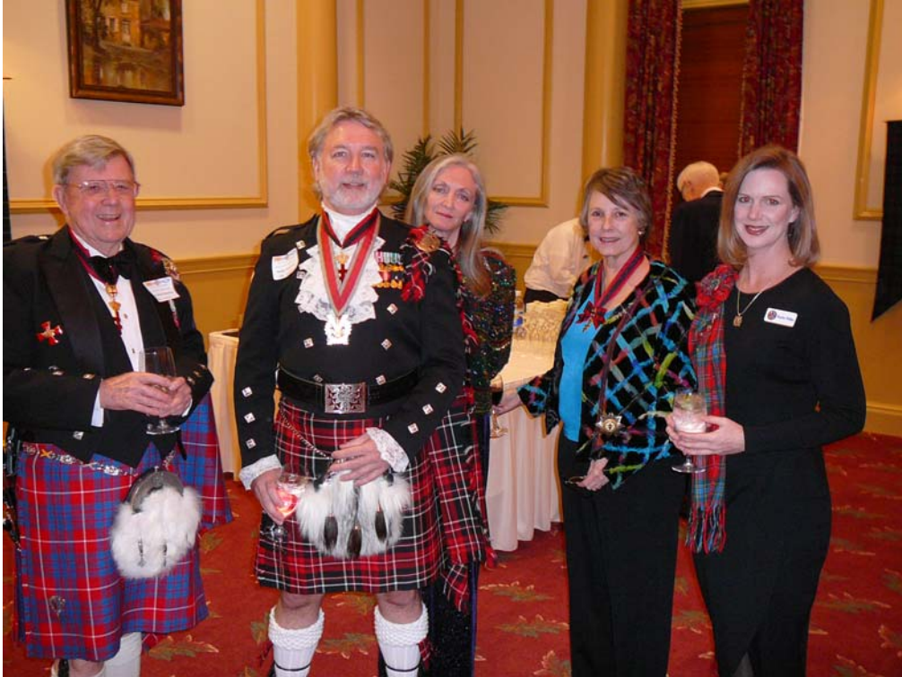
Caught by the paparazzi (above)