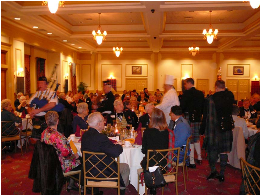
The haggis takes a walk