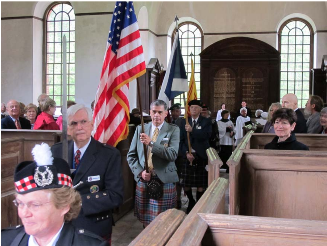
Color Guard (below)