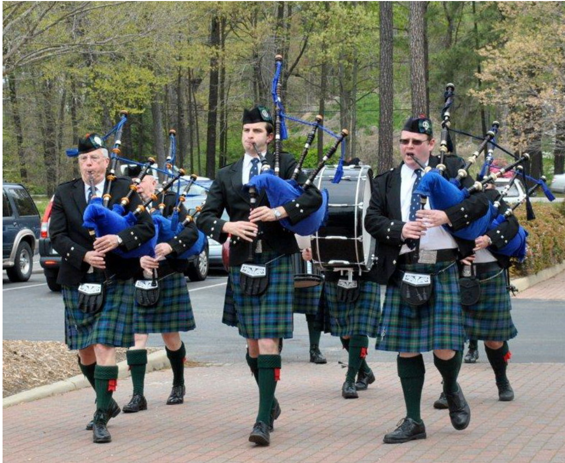
The Williamsburg Pipes & Drums at Tartan Day