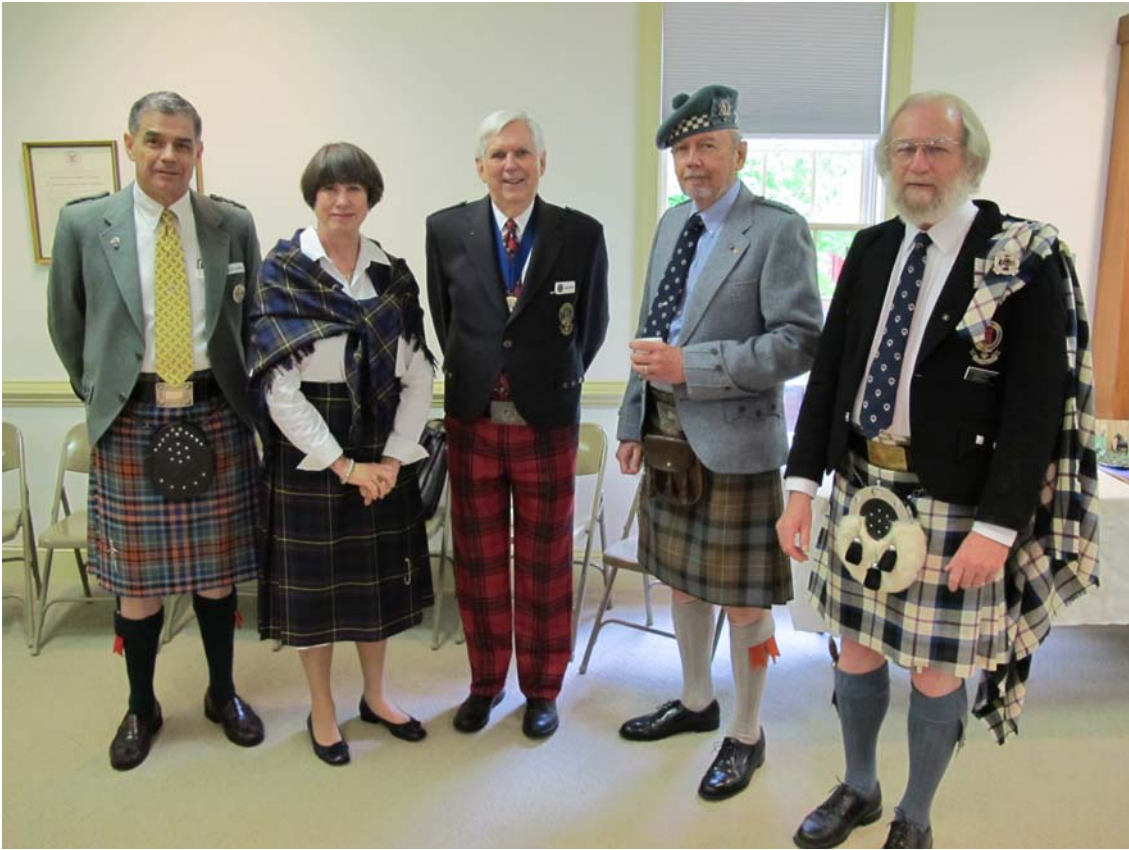
Visitors Center (above)