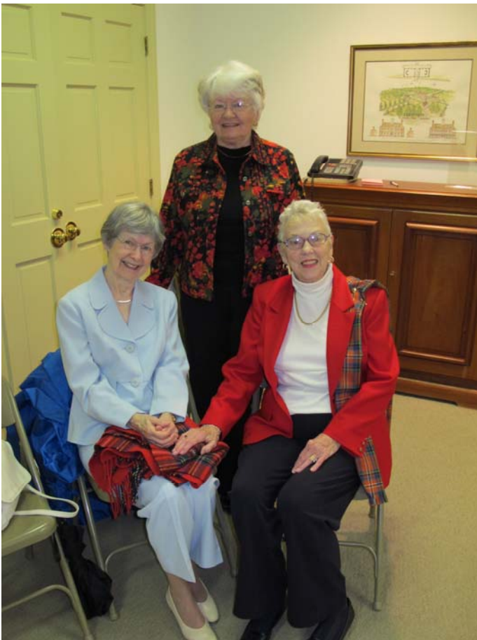
SAS members and guests in the visitors center before the Church service