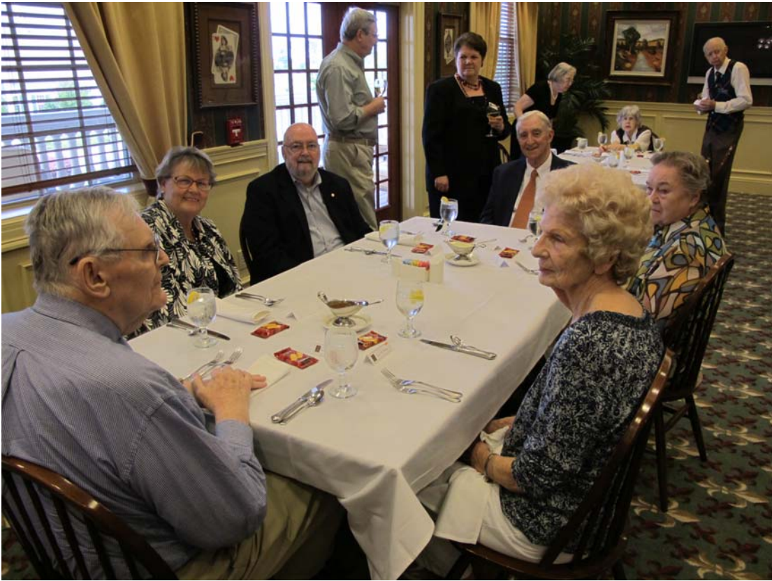
SAS members enjoy the gathering. The unusual electric hat worn by your editor (bottom, right) is an old highland tradition.