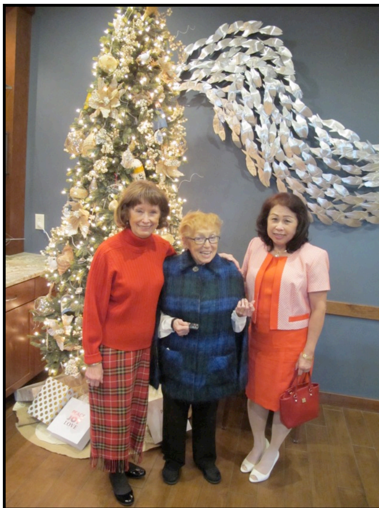
The Girlie Gang