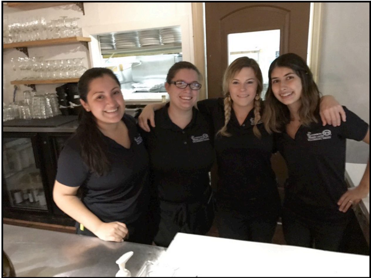
The lovely maidens