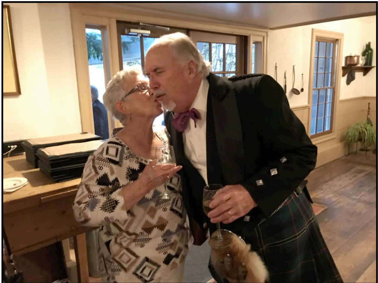
A kiss for luck