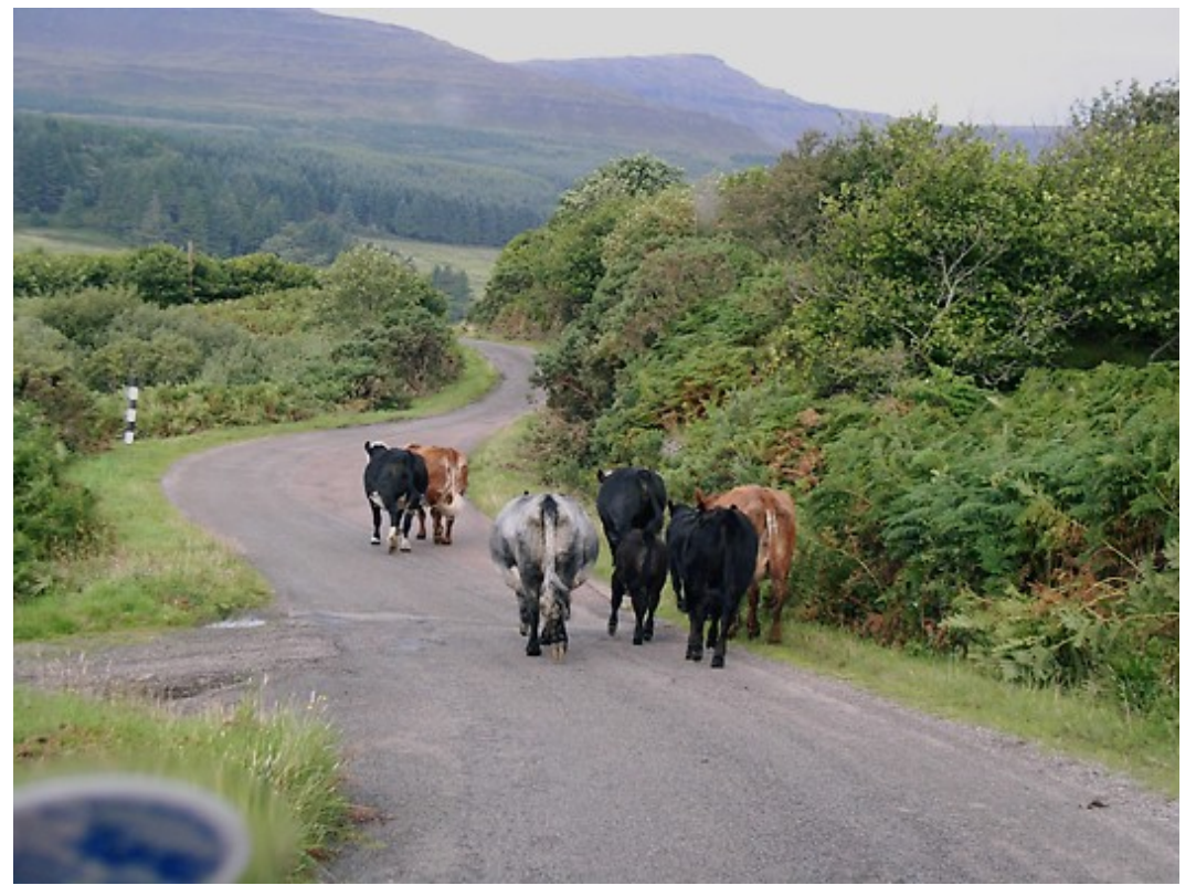
Traffic jam on Skye.