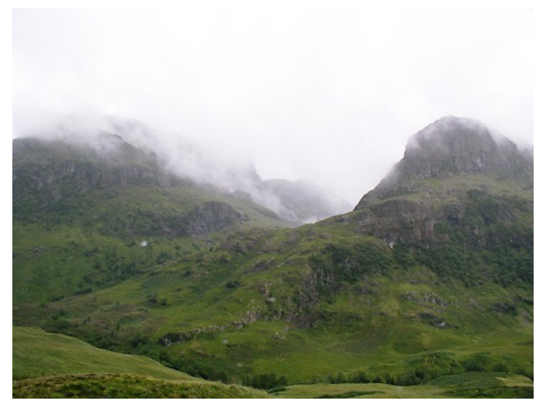
Glencoe.