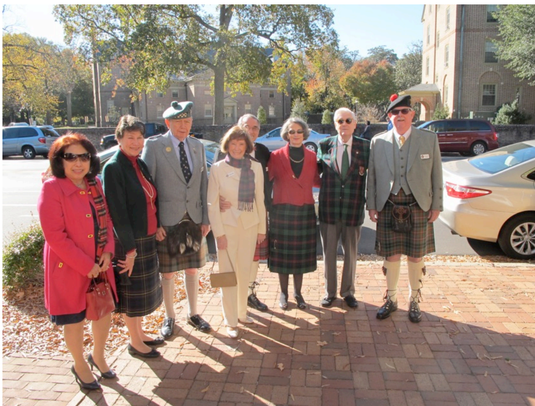
Kirking of the Tartans