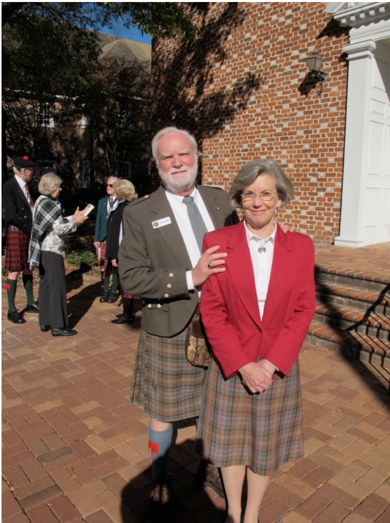
Kirking of the Tartans (above). AGM (below)