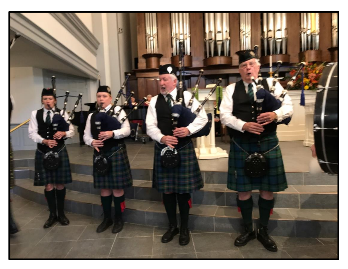
Williamsburg Pipes and Drums at the Church