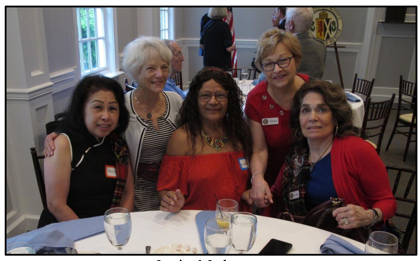
Lassies & Lads