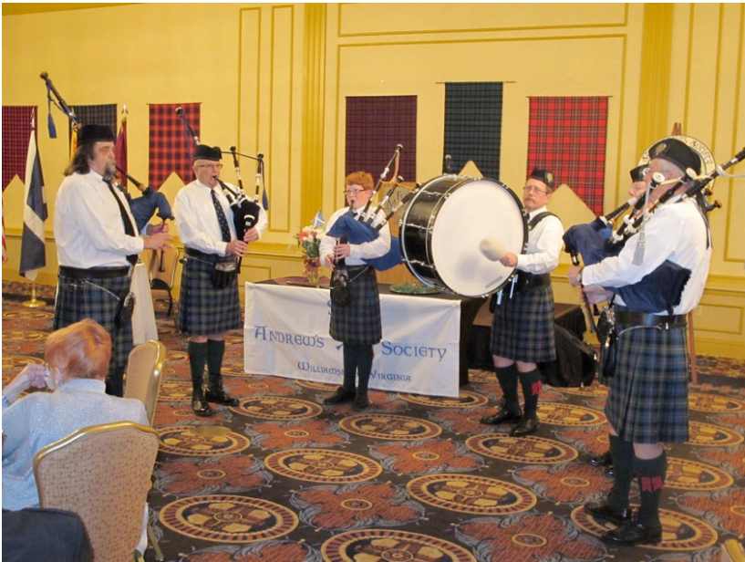
Williamsburg Pipes & Drums