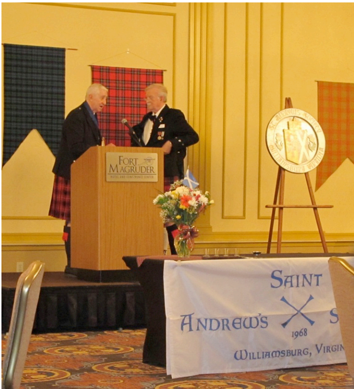
Turnover from Old to New President