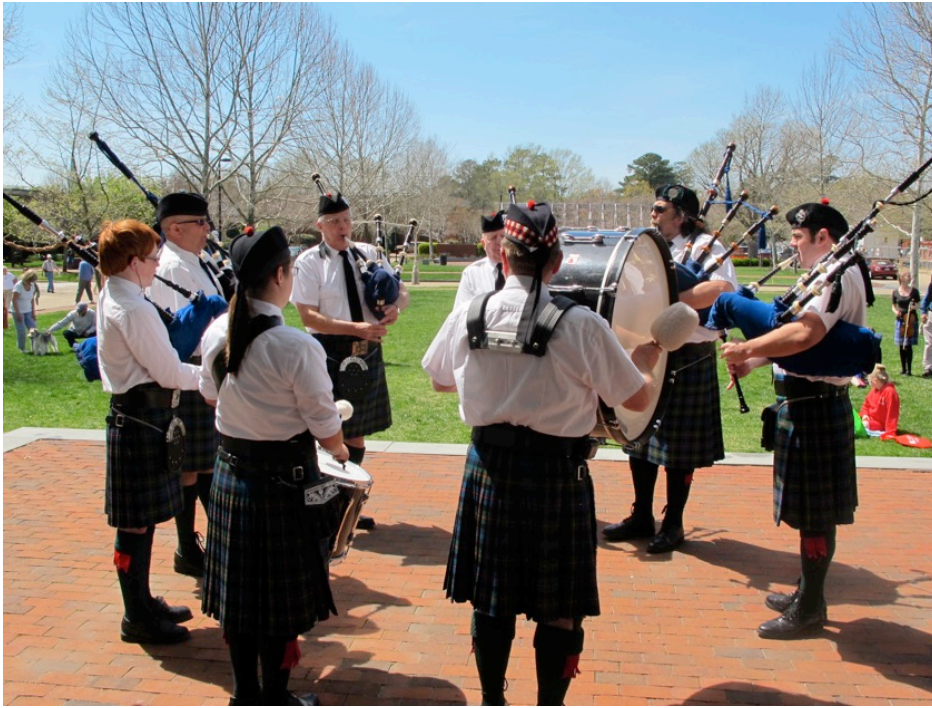
Williamsburg Pipes & Drums