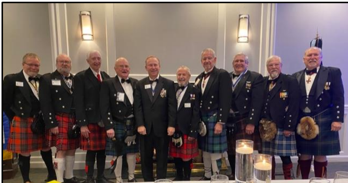
Joint Williamsburg-Yorktown SAR Installation