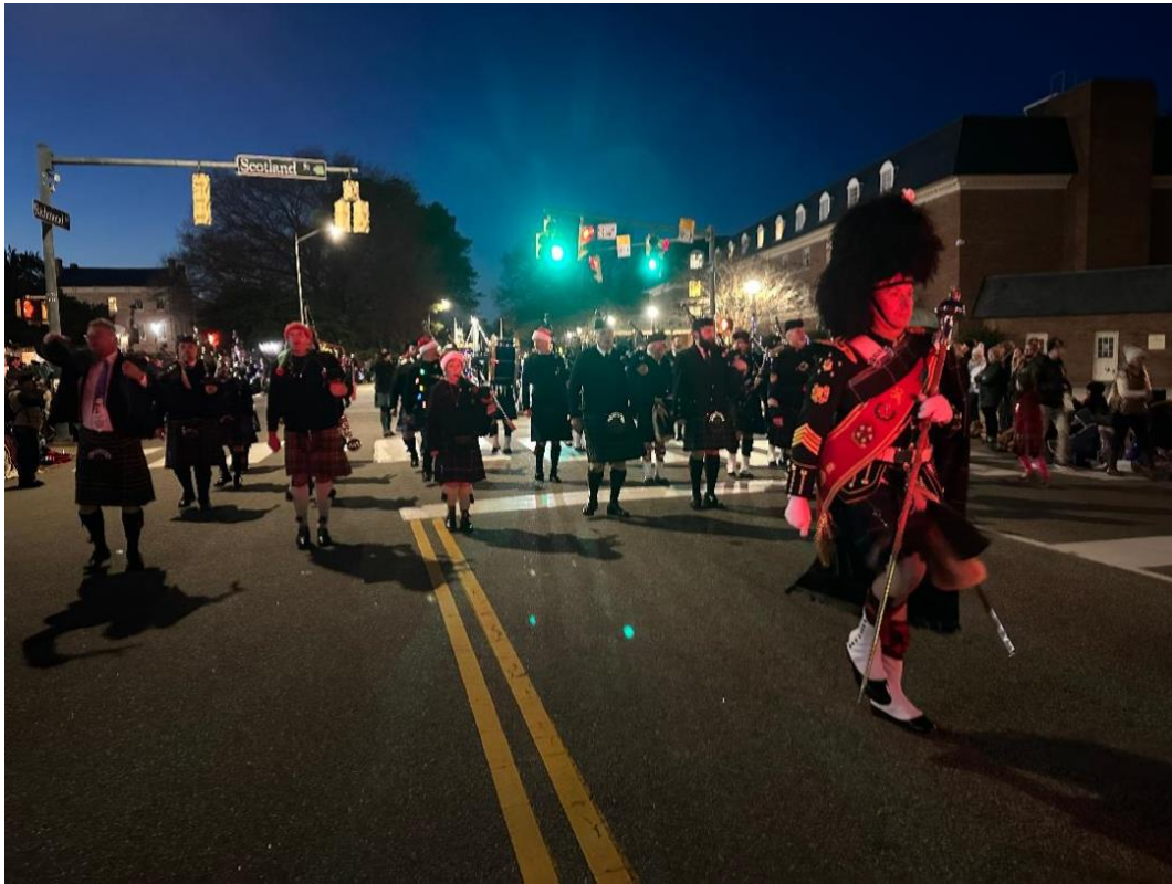
Passing Scotland Street (above) SASW Float