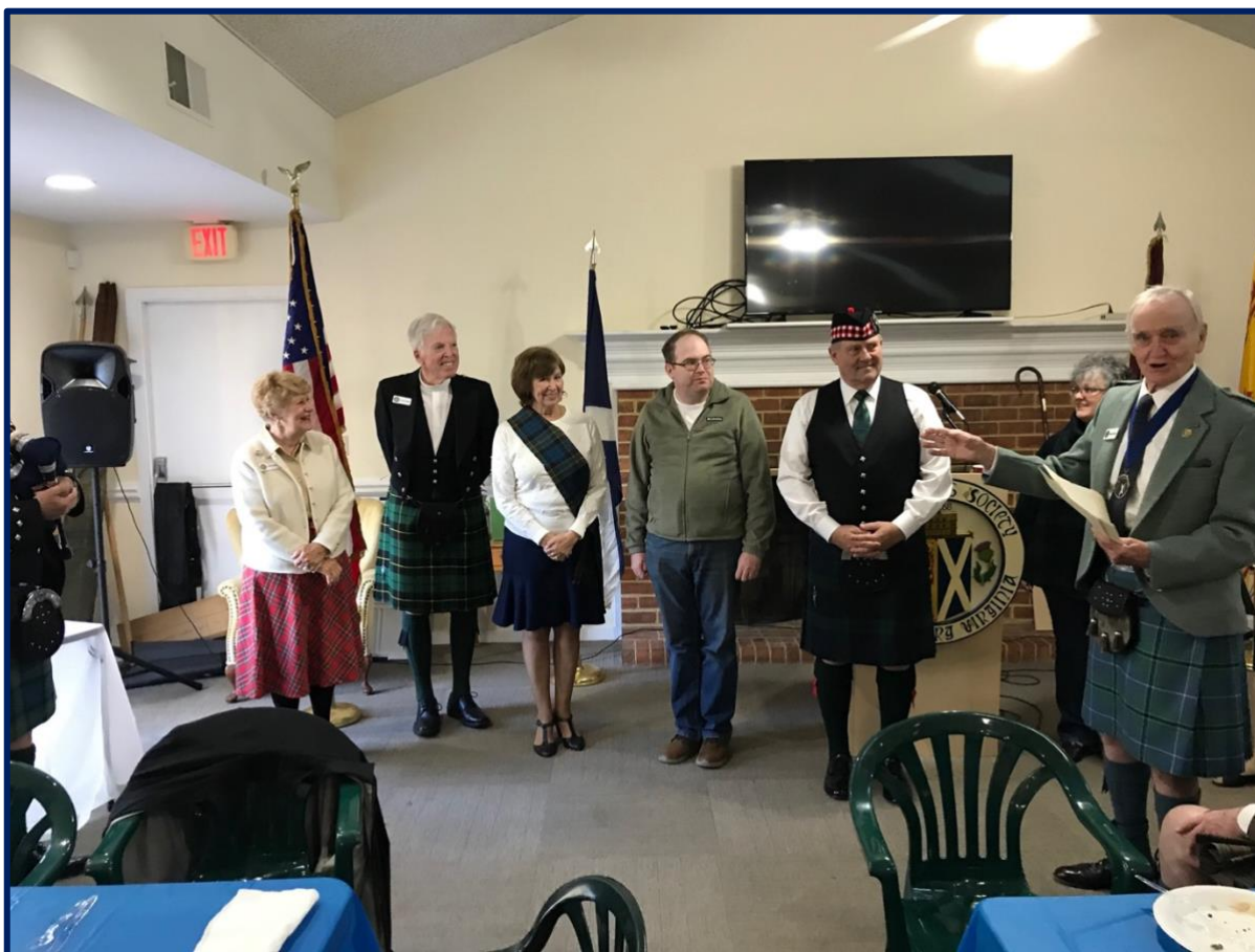
New Society members (above)