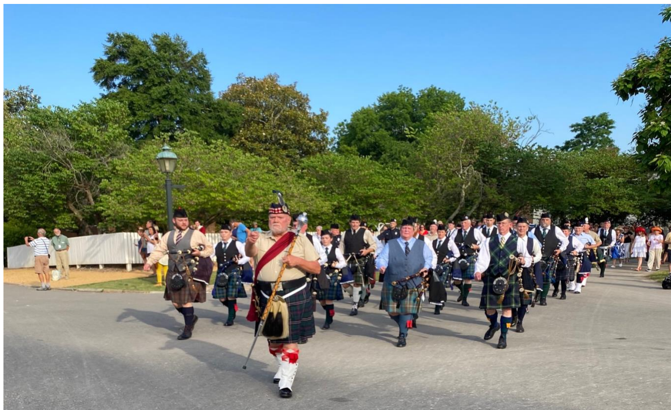
Massed Bands Terri photos