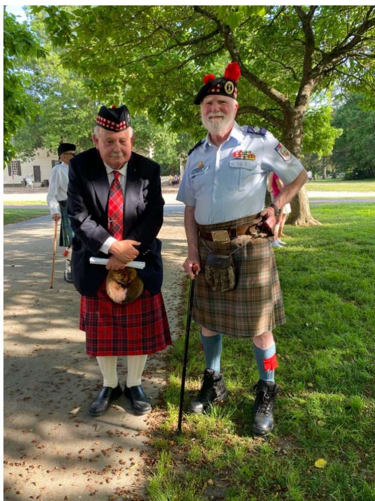
Old Timers Terri photo