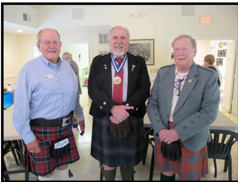
The Society glitterati pose for the paparazzi