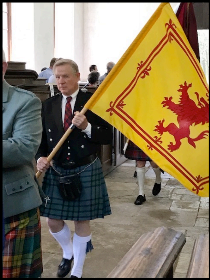
The Color guard