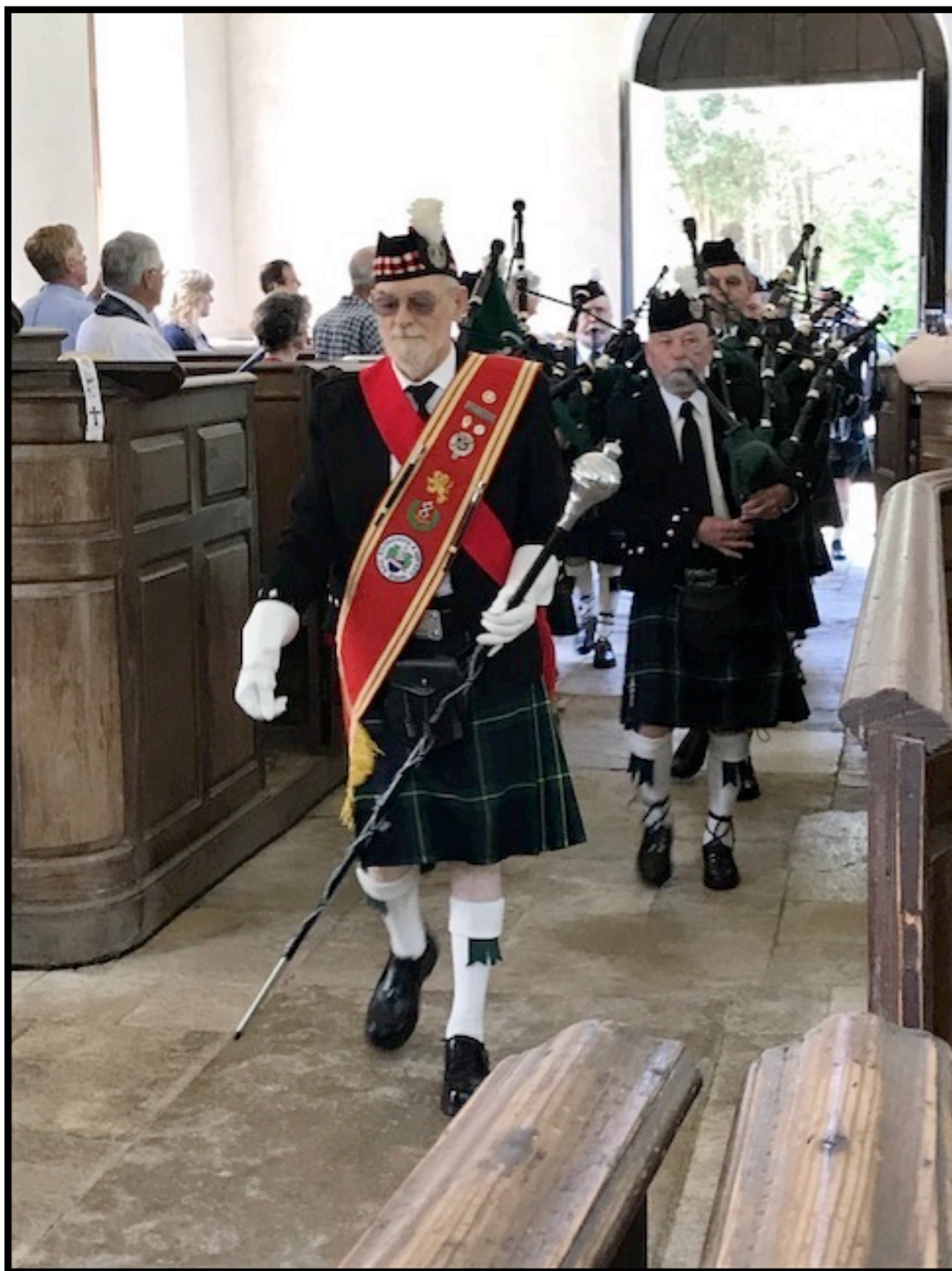
Enter the Kilmarnock & District Pipe Band