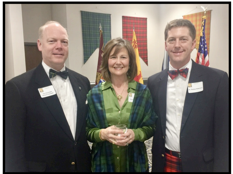
The Burns Nicht gala